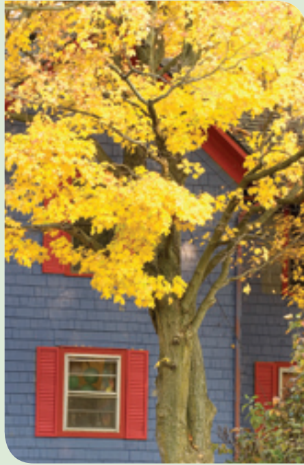
Well-placed trees can help homeowners save energy by shading their homes.

More information about tree care and the benefits of planting trees is available on the Arbor Day Foundation website ( http://www.arborday.org ).